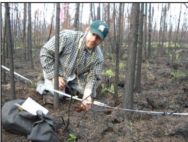
Figure 3. Field data collection of burn severity and fuel consumption in July of 2005 at the 2004 Taylor Highway burn, Alaska.

Field data for regions in Alaska and Canada are available, while data collected for regions in western United States are few. In the summer of 2005, MTRI staff helped in field data collections in Alaska at sites which had burned in 2004, the largest fire year in recorded history for Alaska (Figure 3).